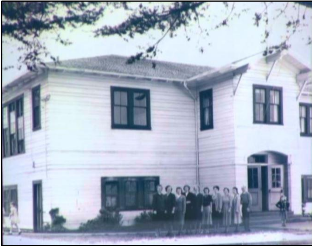
San Pedro School, now City Hall, Sharp Park. Circa 1947.