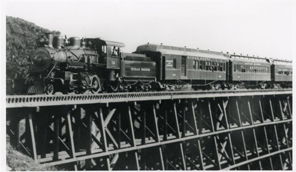
The Ocean Shore Railroad steams along a coastside trestle, somewhere between 1908 and 1920. The railroad ceased operations in 1920.

"The Laguna Salada was named after an arm of the sea that came in and covered a good part of what is now the Sharp Park Golf Course," Bob recalled. "Down by the lagoon, they placed a bathing pavilion. Decks reached out to the water, and bath houses (along today's Clarendon Road) covered the area. Many people took advantage of it, including the boys from San Francisco."